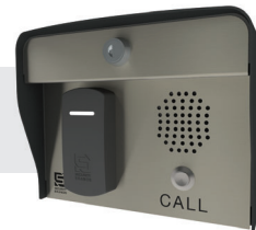
EDGE E2 SECUREPASS + INTERCOM Card Reader (SecurePass) w/ Intercom 27-225

For more information, visit us online: securitybrandsinc.com