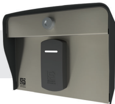
EDGE E2 SECUREPASS Card Reader (SecurePass) 27-220