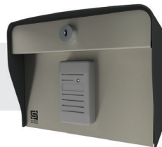
EDGE E2 HID Card Reader (HID) 27-220HID