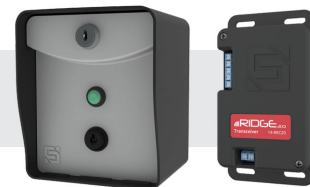
14-RTE433 Ridge RTE 433-MHz Transmitter and Transceiver

For more information, visit us online: securitybrandsinc.com