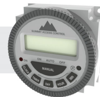
55-T110 110-VAC Timer

For more information, visit us online: securitybrandsinc.com