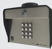
Ascent K1 Cellular Keypad 25-K1