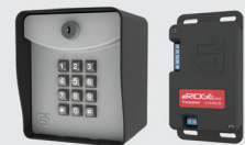
Ridge 2.0 Wireless Keypad & Transceiver S-14-500